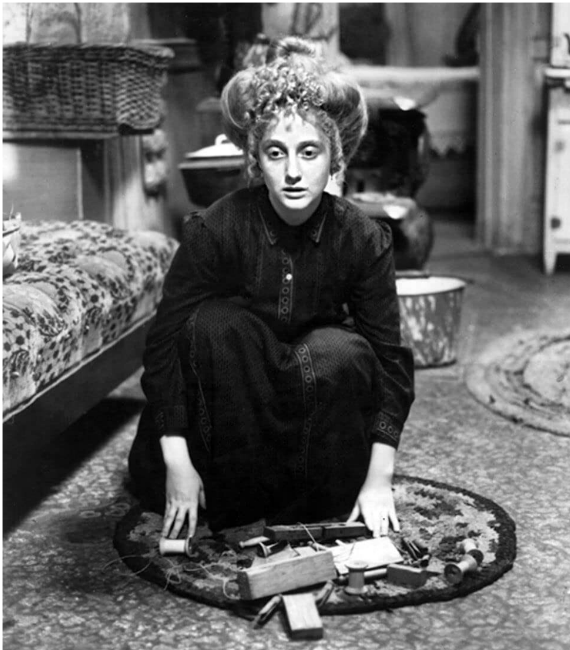
Joan directed Carol Kane in Hester Street in 1975