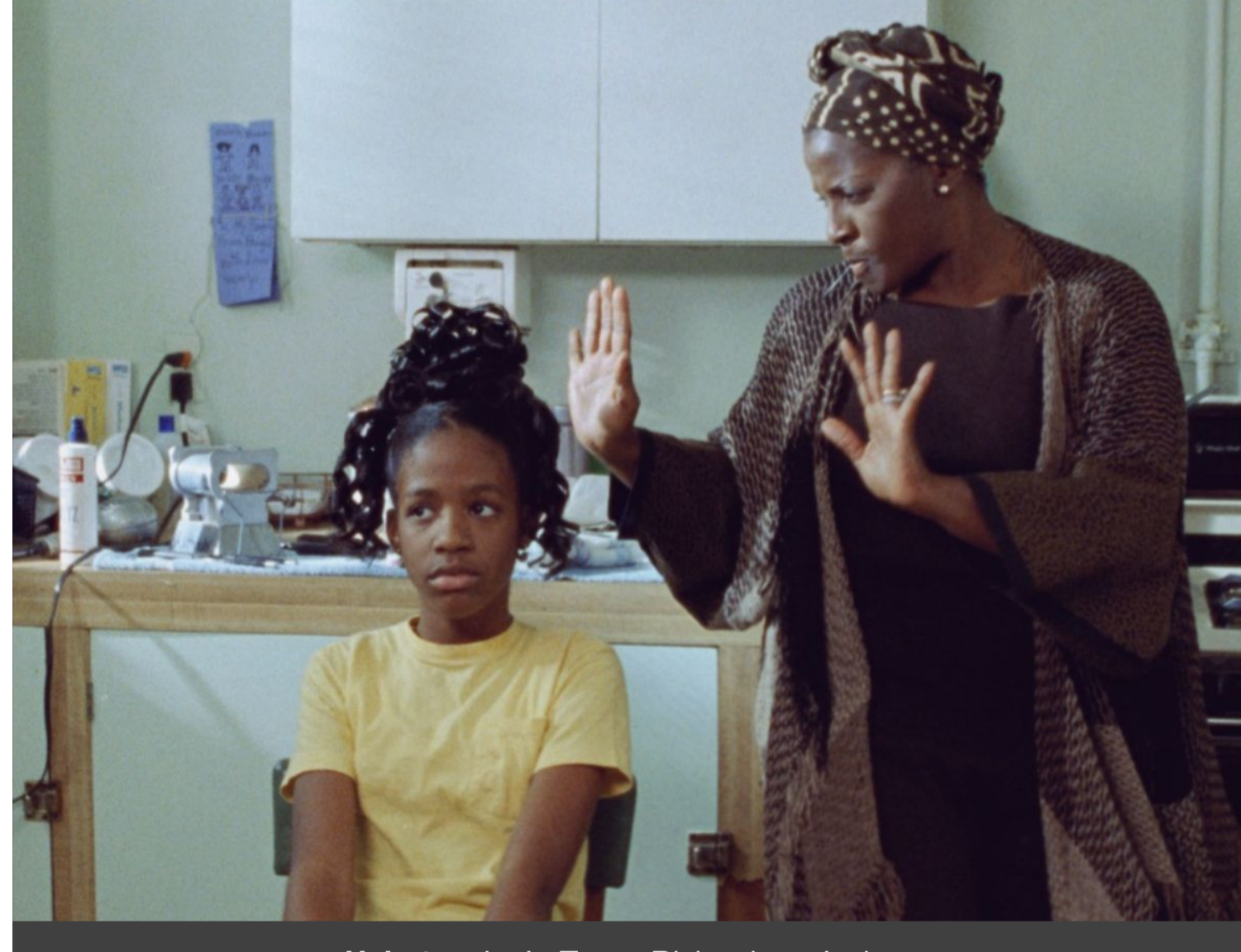
Hairstory by LaTanya Richardson Jackson

A comedic drama about a mother's travails with her young daughter's hair, this film shows that actress LaTanya Richardson (wife of actor Samuel Jackson) should have made more films! Restored with funding from the Hollywood Foreign Press Association and donors to our Jane Fonda Fund for Women Directors, this restoration is nearly completed, and we look forward to bringing it to new audiences in the New Year.